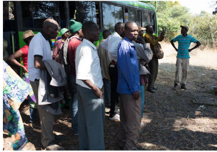
Local community in Katavi National Park

Despite living on its doorstep, few local community members have ever visited Katavi National Park. Each year, we support and organize community members from villages bordering KNP to visit the Park through a “Day in the Park” program. The goal of the program is to give locals a chance to learn about wildlife and develop positive interactions with park staff. In 2017, we were able to take 180 youths, 30 former lion killers, 60 community leaders and 60 traditional medicinal practitioners