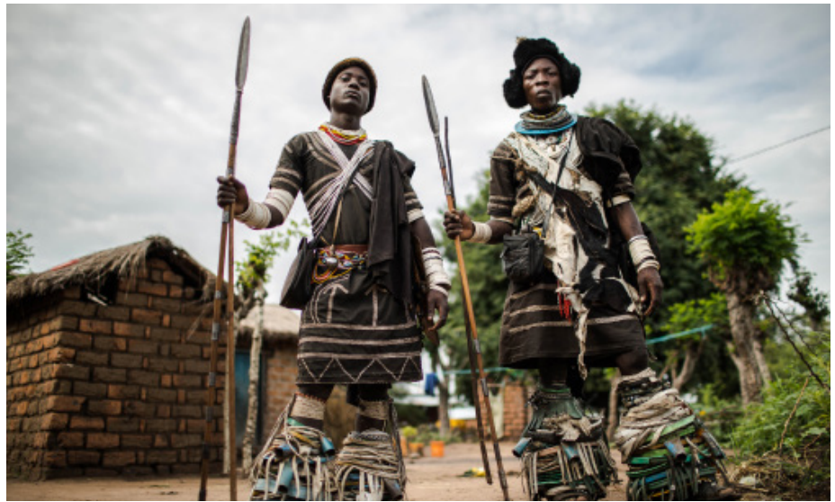
Lion dancers (killers) at Usevya village