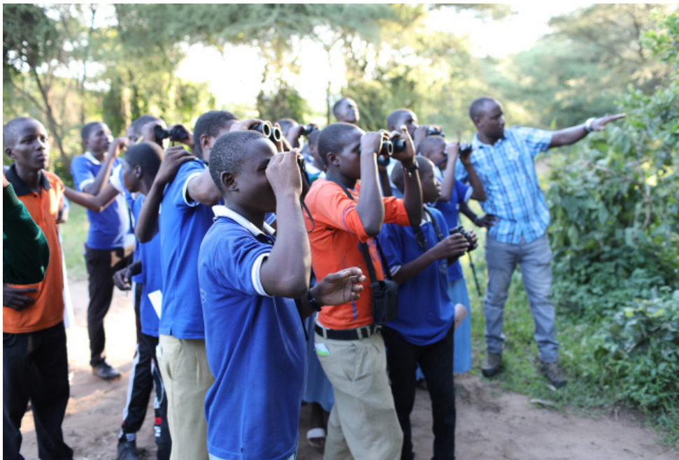
Youth using binoculars donated by UC Davis during the outdoor learning activities.