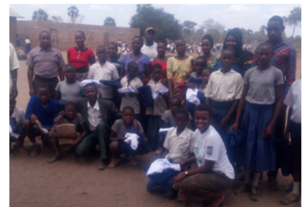
Former lion killers students and their parents

The Student Support Program (SSP) supports students from families of former lion dancers (killers), lion dancers’ supporters and marginalized families relying heavily on natural resources. By providing uniforms and class materials to these target families, we reduce the needs to harvest charcoal, bush meat, timber and fuelwood so as to raise the cash they would otherwise need to purchase these items. In this program, we aim to reduce the burden to parents and guardians whose families live close to reserve boundaries, and to encourage conservation values. A total of 92 pupils benefited from the SSP for the first time in 2017. The support included school uniforms and class equipment (shirts and trousers or skirts, pen and exercise books). Next year, we will support 200 primary and secondary pupils in Mpimbwe extending support to other school requirements like sustainable water reservoirs, classrooms, furniture and books to create a conducive environment to retain children in school as well as motivate them towards a hopeful future.