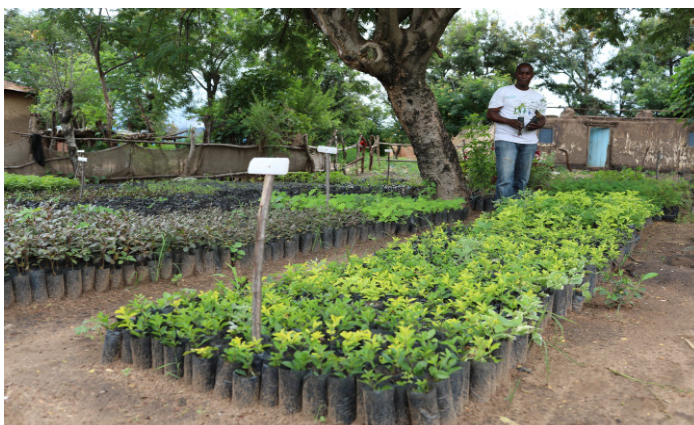
LCMO Kibaoni village tree nursery

The Greening Mpimbwe Campaign has been spreading environmental conservation messages in Mpimbwe by supporting tree planting since 2015. The campaign has been responsible for the planting of 8734 trees and 11 kinds of timber and non-timber trees. Together with Tanzania National Parks and the District Forest Office, in 2017, we purchased 22 kgs of tree seeds and 25 kgs of polythene tubes for the upcoming rain season.