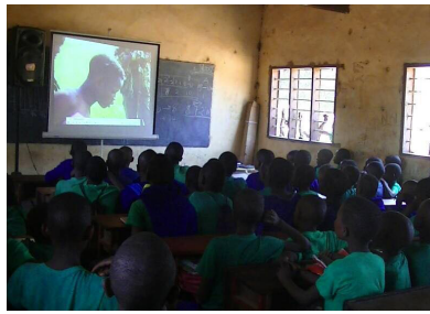
Conservation film class with primary school students

Over 5000 in school and out of school youth were reached with various VIMA project activities. About 20 youths have benefited financially through our alternative livelihood program