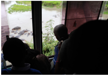
Youth watching Hippos from the bus during the Day in the Park.

from Mpimbwe to visit the park and interact with the park authorities, where they got a chance to discuss the importance of national parks and different ways that they can collaborate to protect the wildlife in it. During the “Day in the Park”, participants visit many of Katavi’s finest sites, including Lake Chada where the Mpimbwe god ‘Katabi’ is thought to herd his hippopotami. They are also given presentations by Tanzania National Park staff sergeants and rangers in which they learn about the benefits of national parks.