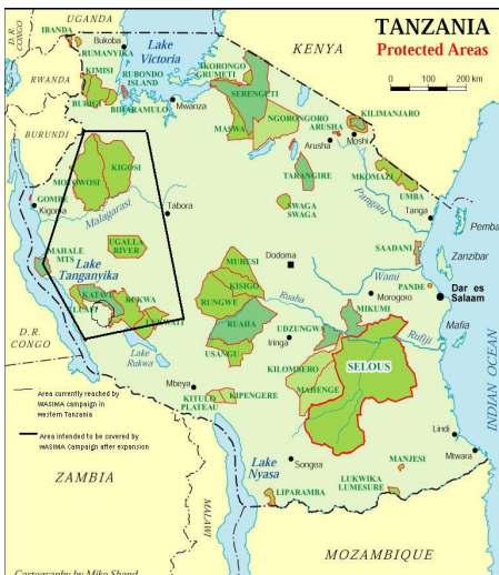
Map showing areas that WASIMA will be expanding to