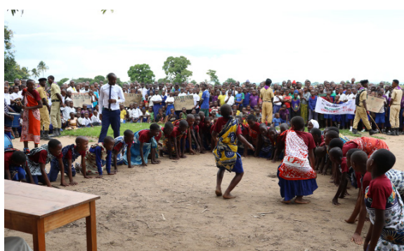
Youth performing ngoma dance during our outreach event

youth organize outreach events in public in order to spread conservation messages through singing, drama, and dancing. Our last event was conducted on March 10, 2017 when more than 2000 community members attended. The project has been working with 5 schools so far and established 3 registered village youth environment clubs.