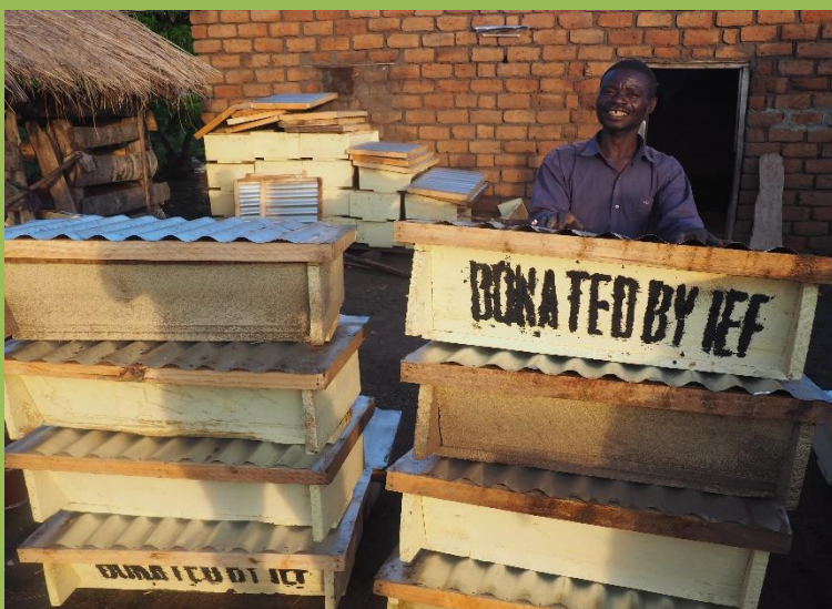
A farmer in Kibaoni with part of the hives donated to the network

Beekeeping is one of alternative livelihood projects that LCMO supports to help raise the standard of living of communities bordering Mpimbwe WMA and Katavi National Park.