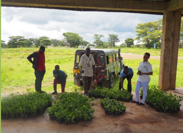
Lyazumbi (Nkasi) farmers receiving trees donated by LCMO

The Greening Campaign in Mpimbwe aims at environmental restoration through active tree planting, and nursery development. We protect remnant natural forests within village lands, and promote environmental awareness in villages in Mpimbwe District.