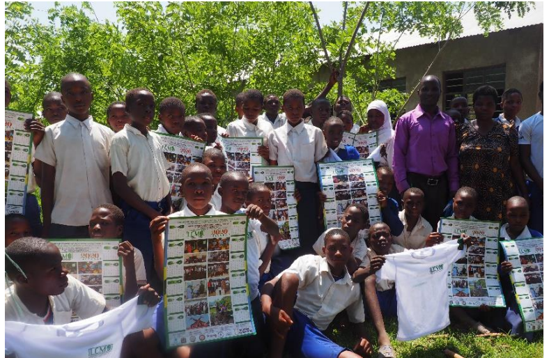
Students from Ikuba Primary school with LCMO calendars and T-shirts. Photo taken after an environmental class session.

COVID-19 interrupted this year's education program, with school closures in March. In the first three months of the year students collaborated with their LCMO mentors in tree planting, park trips and indoor class sessions. A group of 50 students from 5 different secondary schools who did well in a specially-designed "lion and elephant conservation challenge" visited Katavi National Park together with our team.