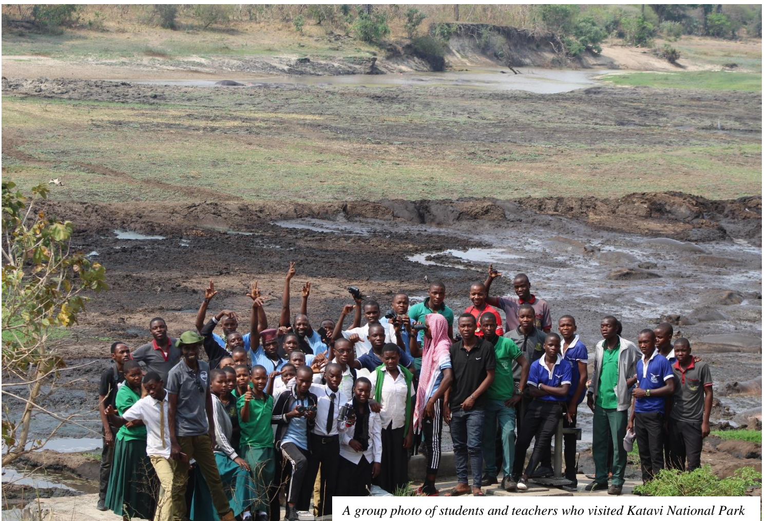
A group photo of students and teachers who visited Katavi National Park

Besides our activities in secondary schools VIMA worked with two youth groups in Kibaoni and Mirumba village. The Kibaoni group was supported with different tree seeds and the Mirumba group received three hives to install in their apiary.