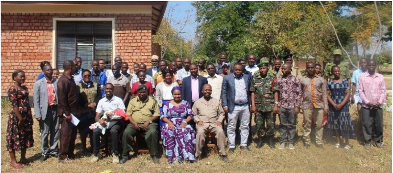
Conservation laws enforcement stakeholders' workshop participants from Nsimbo District

We are a grassroots Environmental Conservation Non-Governmental Organization operating in Western Tanzania. Our mission is to promote conservation and improve community livelihoods. We mitigate human-wildlife conflict and enhance nature-related research and learning, always exploring innovative pathways to develop community-based conservation initiatives with ecotourism, environmental conservation and cultural activities. Our two main programs, Watu, Simba na Mazingira (WASIMA) and Vijana na Mazingira (VIMA), are closely integrated with three campaigns: A Day in the Park, Greening Mpimbwe, and the Student Support program. Currently we are EXPANDING into other parts of Western Tanzania.