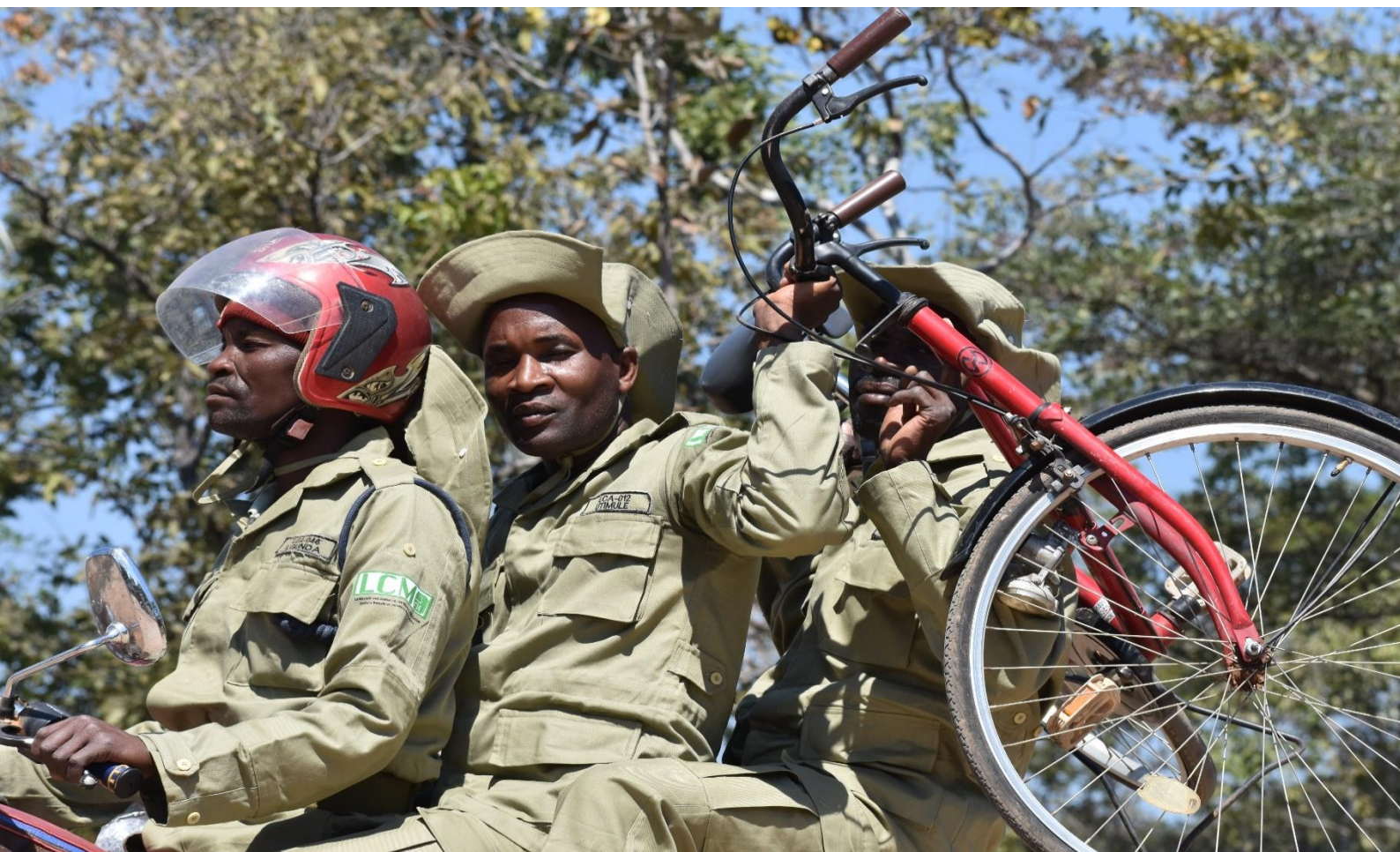
Top photos; Sikonge District Para-Milita Advisor leading the VGS training and photo below is part of the trained VGS in Ipole with uniforms and a bicycle provided by LCMO through WASIMA Campaign.