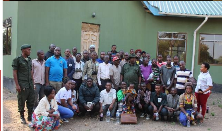
Members of Kizi village council committee in Katavi NP