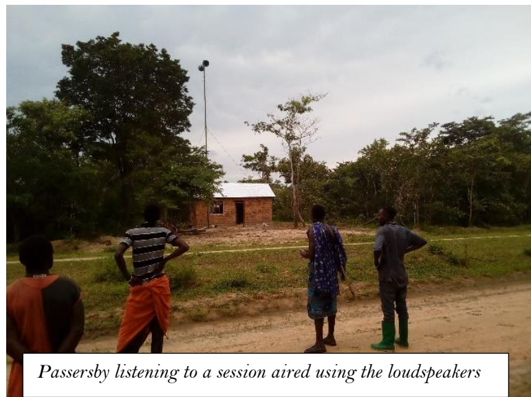
Passersby listening to a session aired using the loudspeakers

We organize free educational park trips to students, farmers groups, livestock keepers, religious leaders, village law enforcement groups, traditional medicine practitioners and village council committees. Since January, two groups of 91 newly elected members of village council committees from Kizi and Sitalike Village visited the park and had insightful meeting with the park wardens.