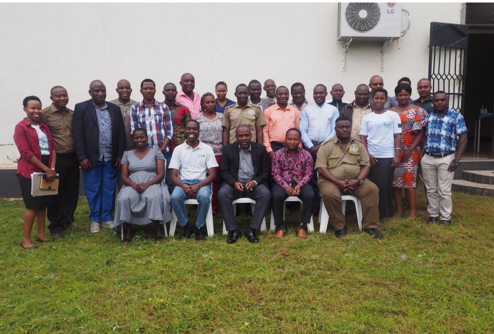
A group photo of the conservation stakeholders who participated in the two day workshop to discuss on the development of ‘The Western Tanzania Lion Conservation Strategy’ .

The document is currently under review in consultation from a team of experts and will soon be approved and made available.