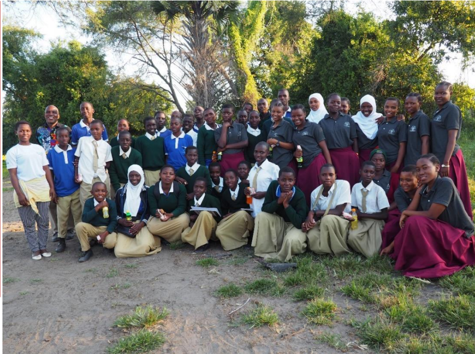
Top photo; Students from Mirumba Primary school below; students from Mizengo Pinda Secondary school during their eco-study trip

Through the support of Nomad Tanzania, LCMO recently introduced eco-study trips where students from primary and secondary schools visit different areas of conservation importance around their villages as part of the outdoor learning. Such areas include -village conserved areas (i.e.WMA), water catchment areas, hot springs, preserved forests for beekeeping and areas affected by human induced activities. So far, we have conducted two eco-study trips with students visiting Mirumba waterfall for a birding event and Mpimbwe WMA to study on effect of human encroachment and human elephant conflict.