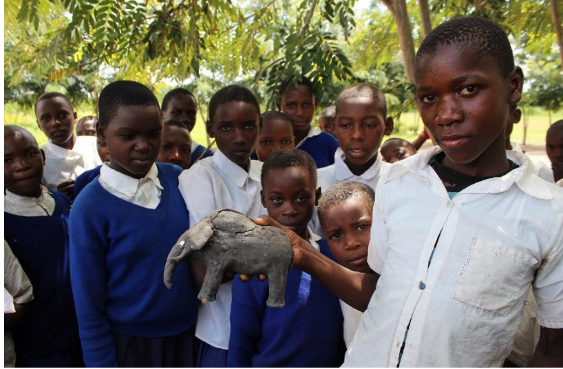
Students from Vilolo PS with an elephant carving drawn during their outdoor session.

Through the ongoing human-elephant conflict mitigation awareness program, Vilolo Primary School, that closely borders Mpimbwe Wildlife Management Area (WMA), held seven sessions with a focus on elephants. Students participated in a challenge that involved using clay to carve animals that have been sighted in the village land, bringing us carvings of elephants, leopards, lions (sighted within the WMA), giraffe, buffaloes, zebras and antelopes. Through these experiences we hope to foster a commitment to wildlife conservation in the next generation.