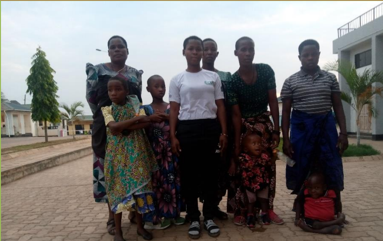
A group of the identified children and their parents at Mpanda Bus Station ready for the trip to Arusha for treatment

LCMO also run an internship program that help to empower, inspire and connect young conservationist to conservation platforms. Through this program, interns develop a wide range of skills relevant in the field of conservation but also able to apply their skills to LCMO and the community. In May, we recruited three interns who work in our station in Mpimbwe and Sikonge and to this extent they have been a great component of our team.