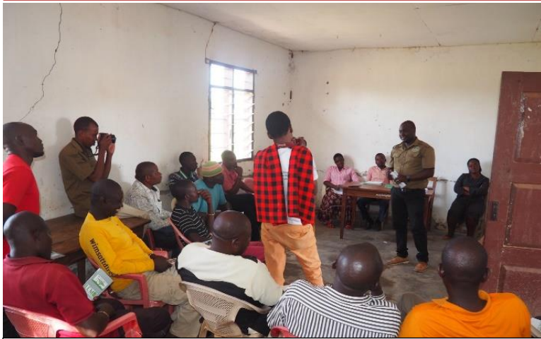
WASIMA-TAWA meeting with livestock keepers in Utende Village, Mlele District.

WASIMA has extended work to 16 (in addition to the previous 22) village councils to halt traditional illegal lion killing and lion dancing through village by-laws approval and execution. Since January, six villages approved by-laws and the process involved about 538 village members. So far, WASIMA records a total of 35 villages that ratified by-laws to ban any form illegal lion killings- including traditional lion killings practices by young Sukuma men in villages around Ugalla and Katavi-Rukwa ecosystem.