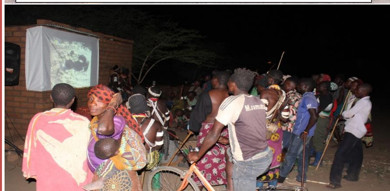
A film show program in Msadya village, Mpimbwe DC