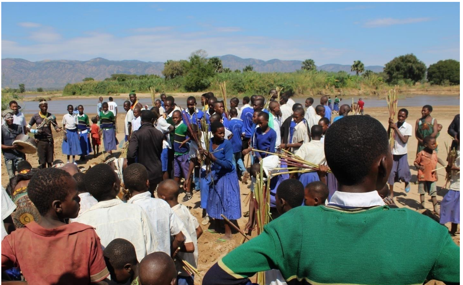
A group of students from three schools planting reeds along the river bank to prevent erosion during the celebration of World Environment Day

For World Environment Day, in collaboration with the Mpimbwe District Council, we organized for an awareness event that brought together youth in school and those outside school in Msadya village which was highly affected by floods and currently much part of land is exposed to erosion. We also participated in planting common reeds ( phragmite australis ) and Gliricidia sepium sps in areas affected by the floods and to reduce further soil erosion.